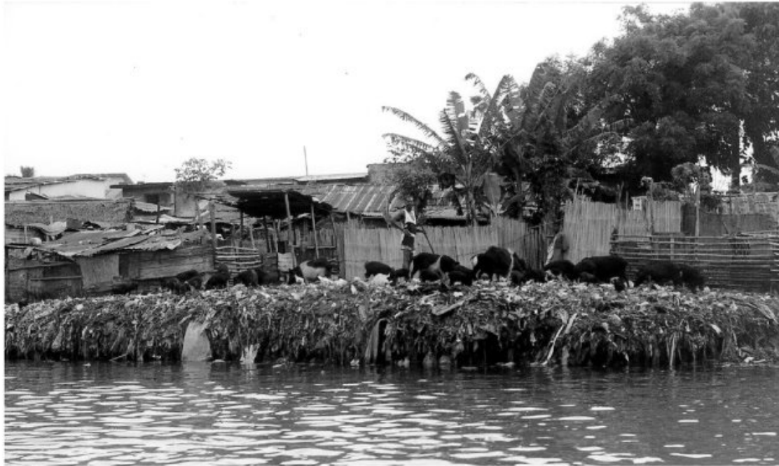
Figure 3. Precarious habitat and insalubrious conditions related to suburban sprawl on a beach plain in Cotonou, the capital city of Benin, West Africa.