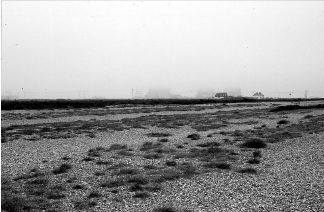
Figure 4. The gravel beach plain of Dungeness in south-eastern England. The linear ridges are highlighted by the sparse vegetation of prostrate broom ( Cystis scoparius spp. maritimus ). In the background can be seen a fishing village and the outline of the Dungeness nuclear power station shrouded in mist.

Understanding the way beach plains form and how their morphology, hydrology, soils and vegetation interact are thus important with regard to the life-support value of these coastal plains. These relationships are examined following a review of the morphology, the sediment composition, the sediment supply conditions and the modes of progradation of beach plains.